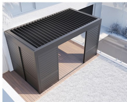
6. INFILL OPTIONS: LOUVRE SHUTTERS AND PANELS