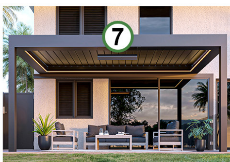
7. FINISHING TOUCHES: LIGHTING AND HEATING