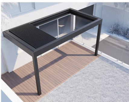
3. RETRACT ROOF