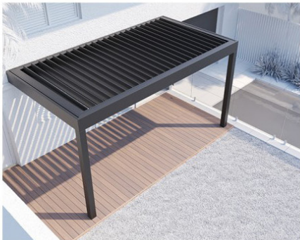
3. OPENING ROOF