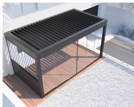
4. INFILL OPTIONS: SLIDETEC FRAMELESS GLASS SLIDERS