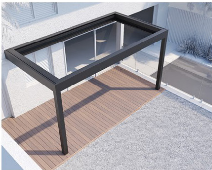
2. STRUCTURAL LOUVREtec FRAME