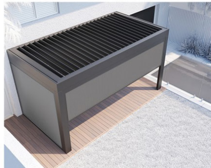
5. INFILL OPTIONS: OUTDOOR BLINDS