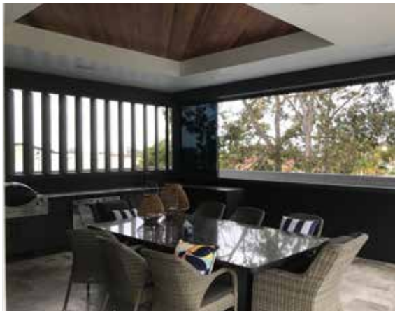
VERTICAL SUN LOUVRES FITTED INTO A FRAME