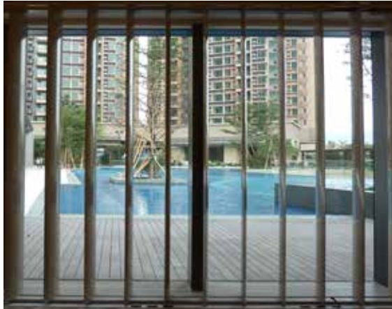
MOTORISED LOUVRE BLADES