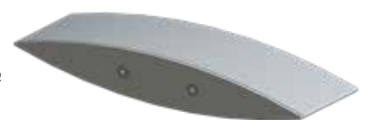
300MM MAXI LOUVRE