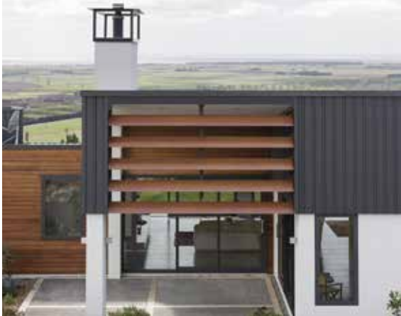
300MM MAXI DRIVE LOUVRE BLADE, FIXED. TIMBER LOOK POWDERCOAT

Please note, our RL300 and RL450 Louvres are also compatible with the Maxi Drive system. Please contact your local Louvretec Dealer for more information. We are focused on meeting your needs with tailored solutions.