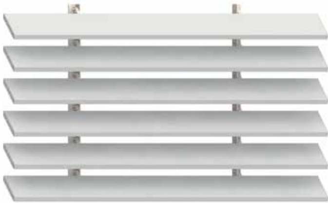
VERTICAL PANEL BRACKET FIXED - HORIZONTAL LOUVRES

All Louvretec Sun Louvres can be Bracket Fixed using Louvretec's proprietary Bracket Fixing Systems. Die cast or extruded brackets are custom manufactured site specific, enabling the louvre blades to be set at any pitch or to any centres.