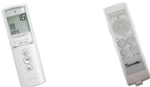
SOMFY TELIS 16 CHANNEL RETRACT ROOF REMOTE