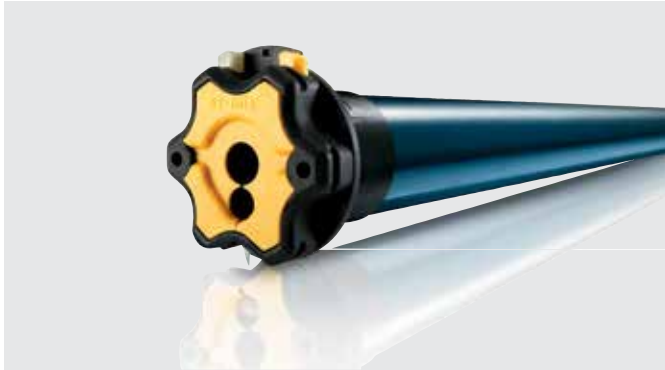
SOMFY TUBULAR MOTOR