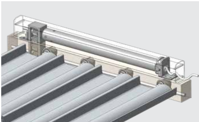
SOMFY TUBULAR MOTOR INSITU