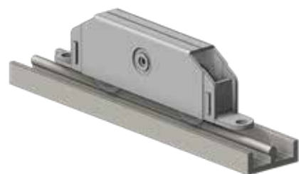
BOTTOM ROLLING SLIDER