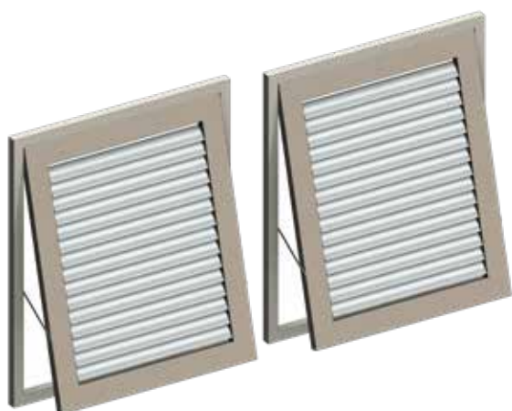
PLANTATION/AWNING STYLE SHUTTERS

Hinged Louvered Windows use standard Hinged Door extrusions and components.