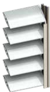
HAND OPERABLE LOUVRE INFILLS USING THE KISS PIVOT SYSTEM

For more info refer to: KISS Pivot System Pages 10.1.03