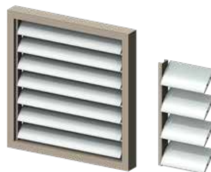
END FIXED LOUVRE SHUTTER