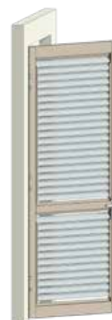
HEAVY DUTY HINGED DOOR

Coastal Ultra Welded Hinged Door Pages 12.27, 12.31, 12.32, 12.33