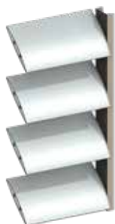
END FIXED LOUVRE INFILLS