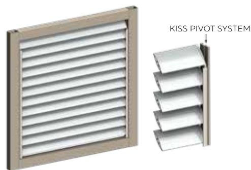
HAND OPERABLE SHUTTER INFILLS KISS PIVOT SYSTEM