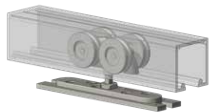
TOP HUNG SLIDERS - CARRIAGE WITHIN HEAD TRACK