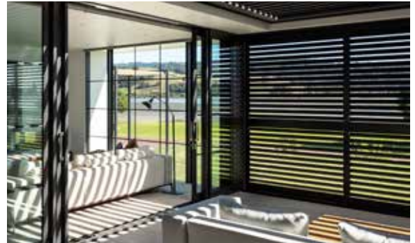
SLIDING SHUTTERS, PAUANUI NZ

All Louvretec Coastal Shutters are manufactured from commercial grade powder coated or anodised aluminium.