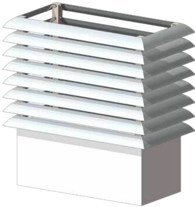
STANDARD LOUVRE DIRECTION SHOWN