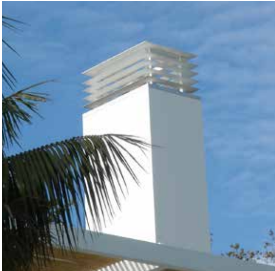
BRACKET FIXED CHIMNEY SURROUND WITH MITRED CORNERS

Determine what size louvre blade will be best suited, both aesthetically and functionally. Wind flow through the louvre blades can assist with the actual venting of the chimney. The surround's support structure can be a combination of aluminium box section, angle or channel. Please discuss with Louvretec.