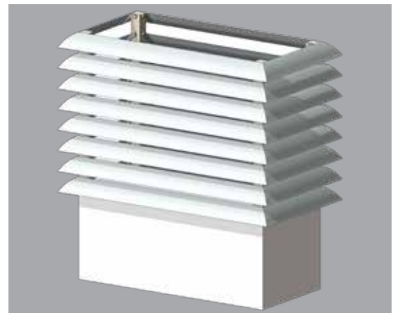
BRACKET FIXED CHIMNEY SURROUND WITH MITRED CORNERS