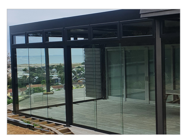
OVERHEAD RECTANGULAR PANELS