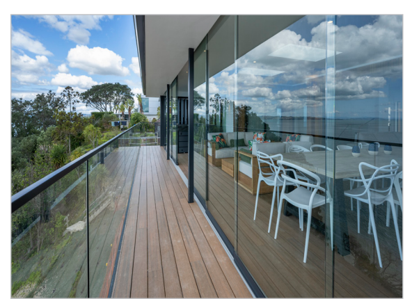
FULL HEIGHT FIXED PANEL