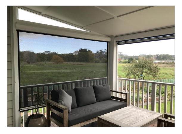
OVERHEAD RAKING PANEL