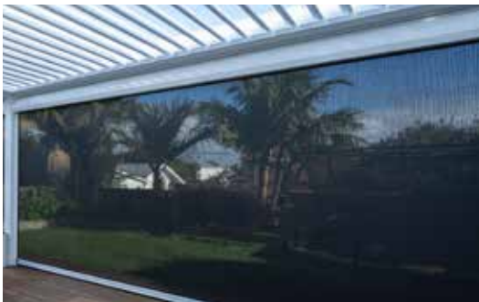
PROTECTION DURING EVERY SEASON