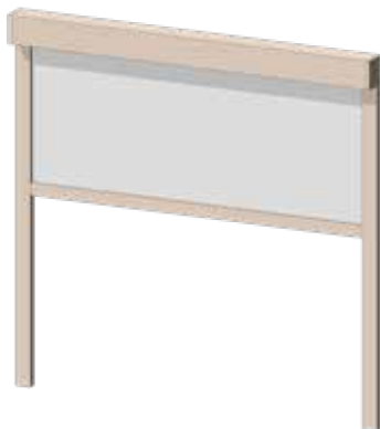
CLEAR PVC BLIND