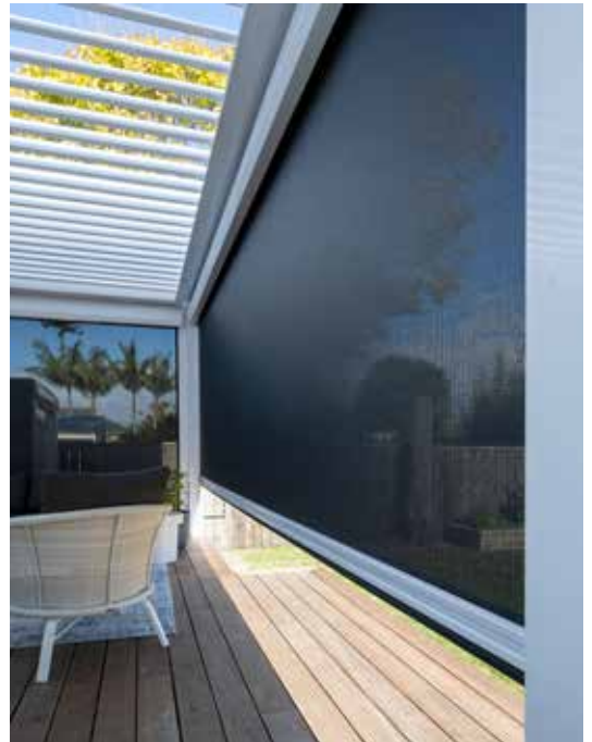
MOTORISED MESH SHADE BLINDS & OPENING ROOF