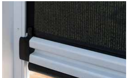
CHOOSE FROM A RANGE OF MESH DENSITY LEVELS OF 'OPEN-NESS'

MOTORISED OR HAND OPERATED Controller and Sensor Options Refer Section 1 for range of options