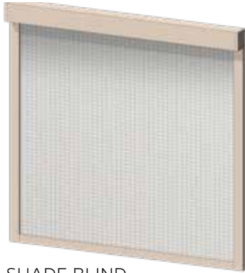
MESH SHADE BLIND