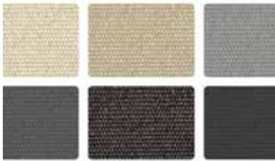
A LARGE RANGE OF MESH DENSITY OPTIONS IS AVAILABLE