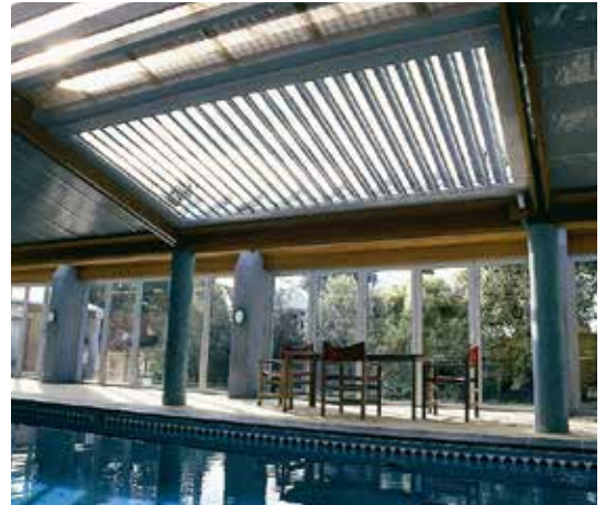
LET'S GET PITCHED