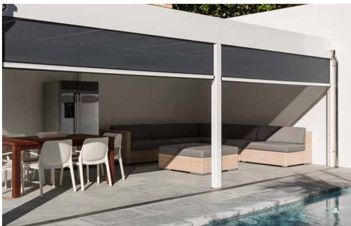
5. MESH SHADE BLIND 6. OUTDOOR ROOM 7. MESH SHADE BLIND 8. OUTDOOR ROOM