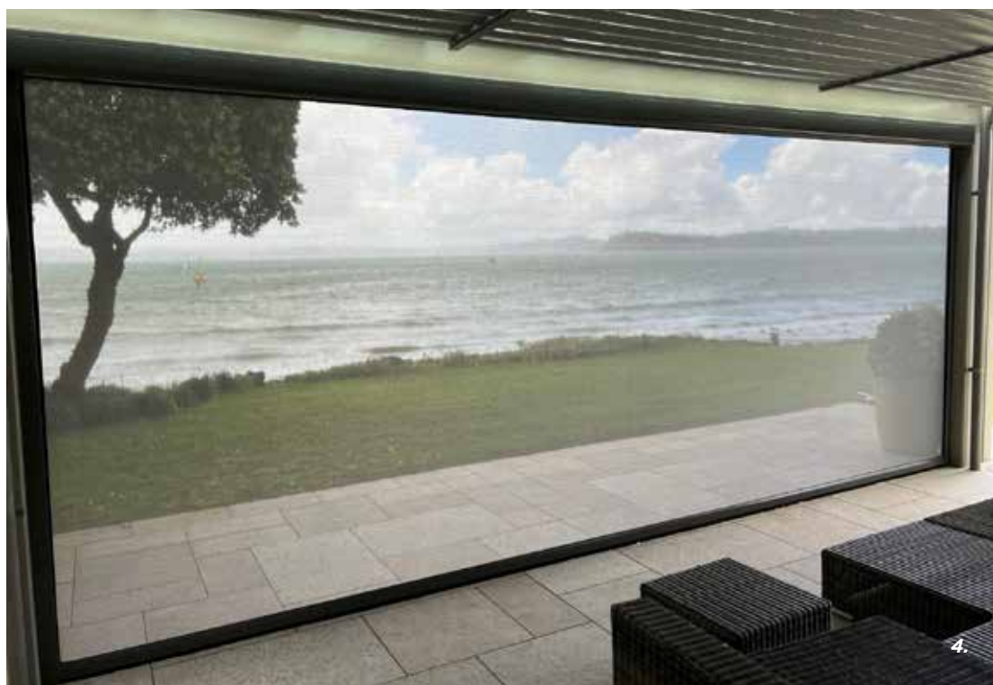
1. MESH SHADE BLIND 2. MESH SHADE BLIND 3. OUT TO THE OUTDOOR ROOM 4. MESH SHADE BLIND