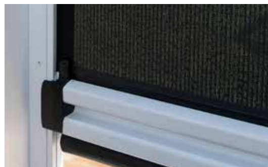
CHOOSE FROM A RANGE OF MESH DENSITY LEVELS OF 'OPEN-NESS'