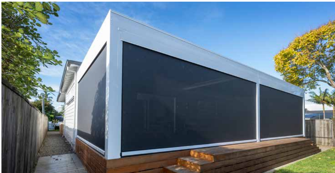
MT EDEN, AUCKLAND