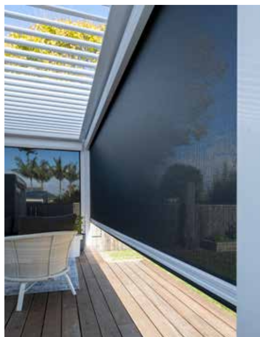
MOTORISED MESH SHADE BLINDS & OPENING ROOF