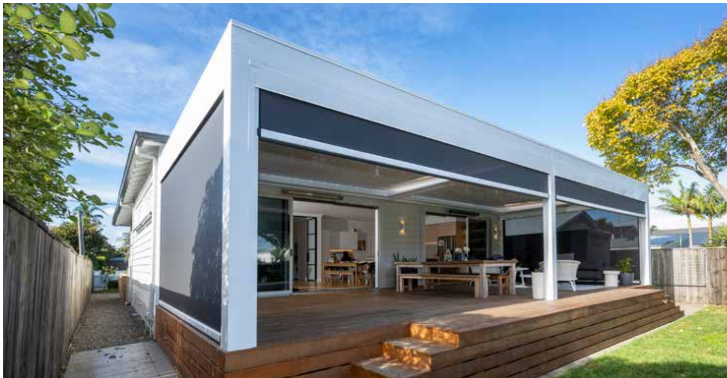
MOTORISED OUTDOOR BLINDS - PART OF A LOUVRETEC OUTDOOR ROOM. EACH BLIND SPANNING 5.4 METRES