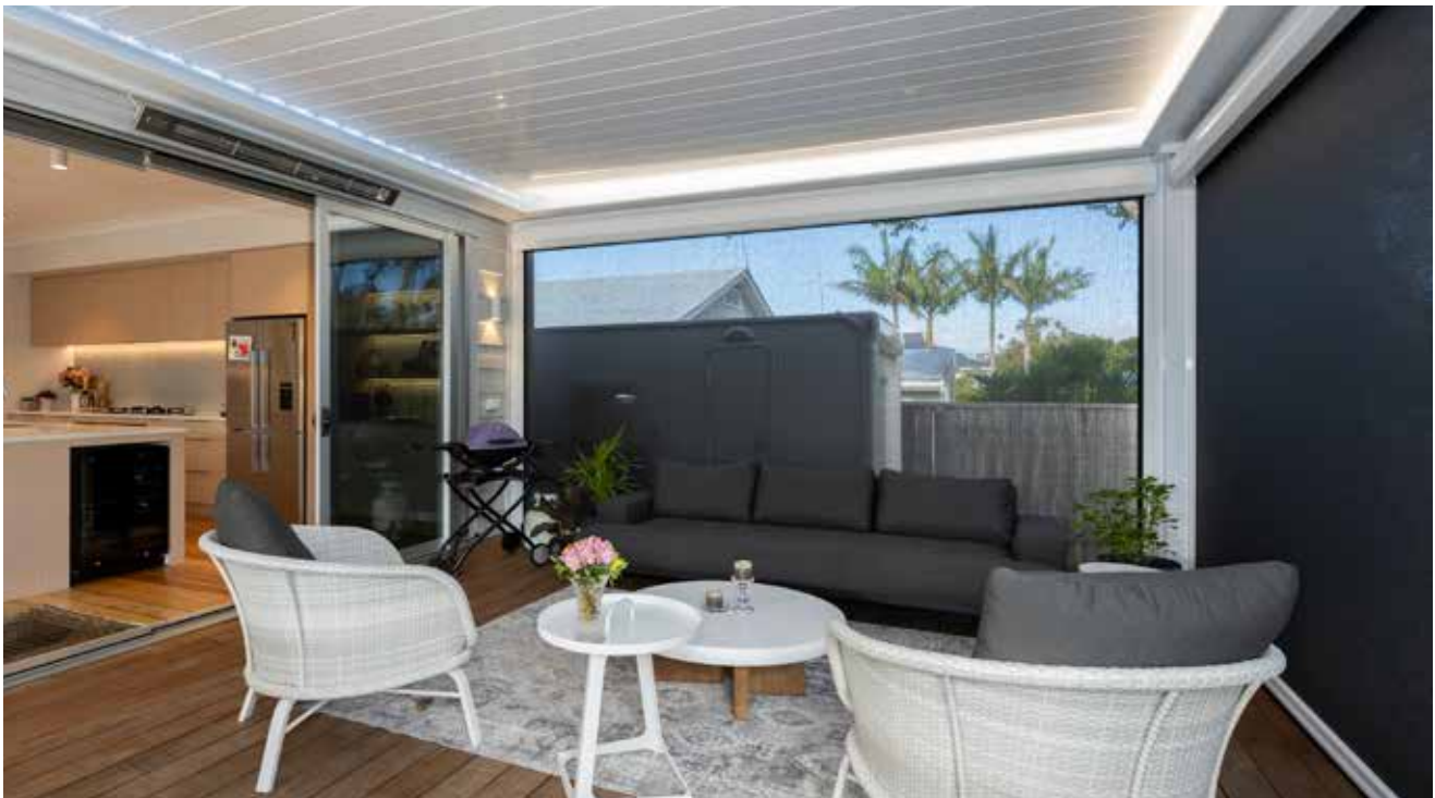
LOUVRETEC ROOM (OPPOSITE PAGE) AS VIEWED FROM INSIDE MT EDEN, AUCKLAND

Many Louvretec Dealers carry mill finish stocks & manufacture the Outdoor Blinds themselves with others receiving kits from their local Outdoor Blind supplier.