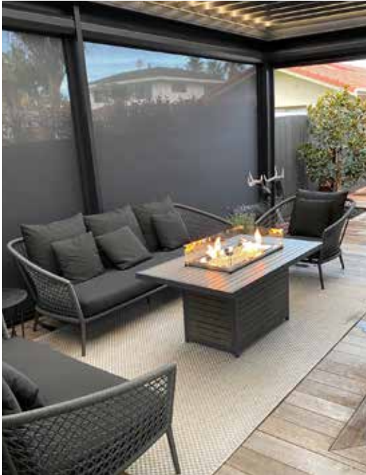
RED BEACH, AUCKLAND